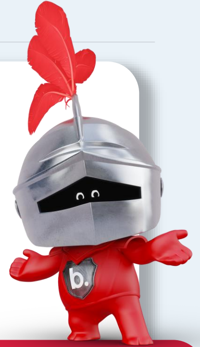
Monthly Rates for Dental Care Plan